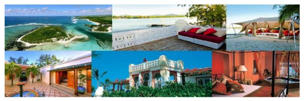
One Day Visit to Ile Des Deux Cocos (LUX* Resorts & Hotels) and to Blue Bay Marine Park

The POWC organised two excursions on 11 August 2019 and 22 December 2019. Three hundred and nineteen participants could avail themselves of the package and discover Ile Des Deux Cocos which is a private island run by LUX* Resort and Hotels. Participants enjoyed the activities, buffet lunch as well as some family moments on the island.