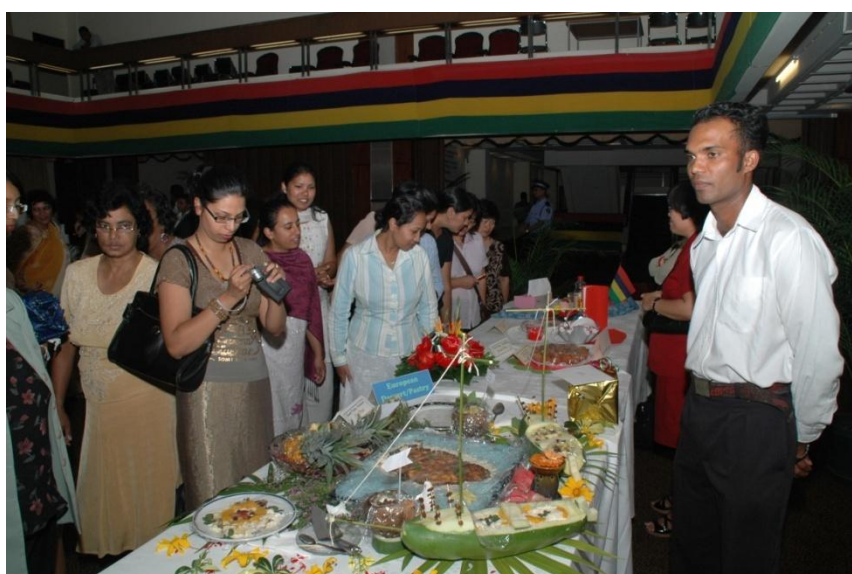
Culinary Exhibition 2009