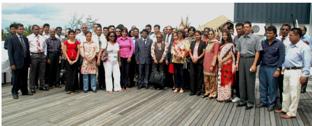
Workshop on Action Plan 2010 at La Plantation Resort & Spa; Group Photograph

“Men are wise in proportion, not to their experience, but to their capacity for experience” – George Bernard Shaw