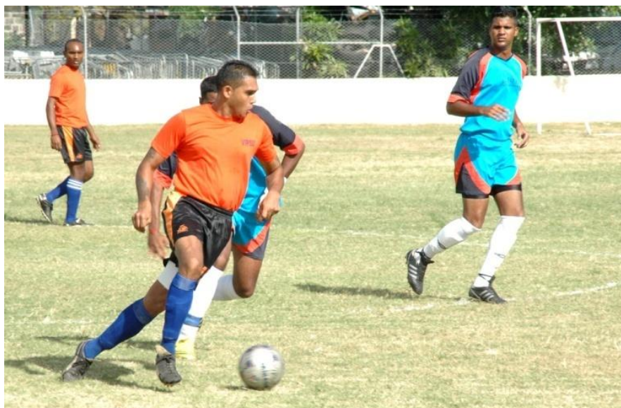
Football Tournament 2009 (Disciplined Force) – Winner: VIPSU Football Team

“The human body is the best picture of the human soul” Ludwig Wittgenstein