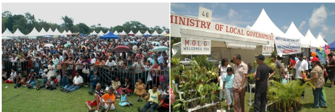
Civil Service Kermesse 2009

“Deep within man dwell those slumbering powers; powers that would astonish him, that he never dreamed of possessing; forces that would revolutionize his life if aroused and put into action”