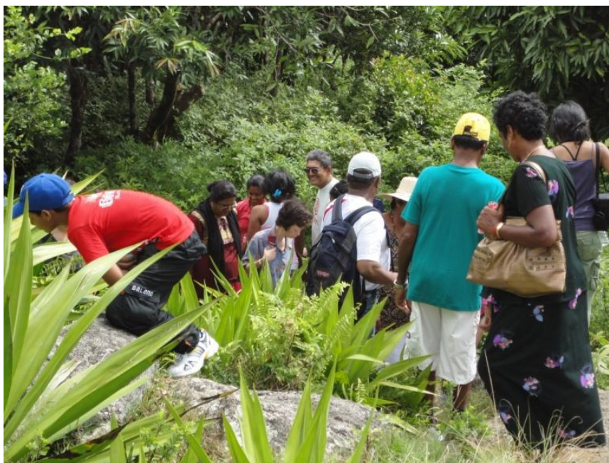
Tours to Rodrigues – Participants at Mt. Limon

(* ) Depending on the schedules discussed and agreed with the Mauritius Shipping Corporation