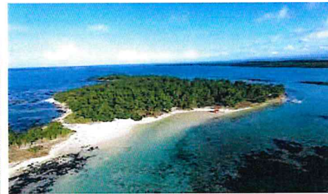
Ile aux Bernache

The Public Officers' Welfare Council (POWC), in collaboration with the National Parks and Conservation Service (NPCS), is organising a Hiking/ Restoration activities to Ile d'Ambre and Ile aux Bernache on Sunday, 30 July 2023.